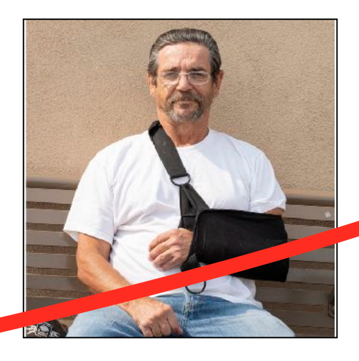
"Homeless Voices Project " 2020 Arts Express Grantee