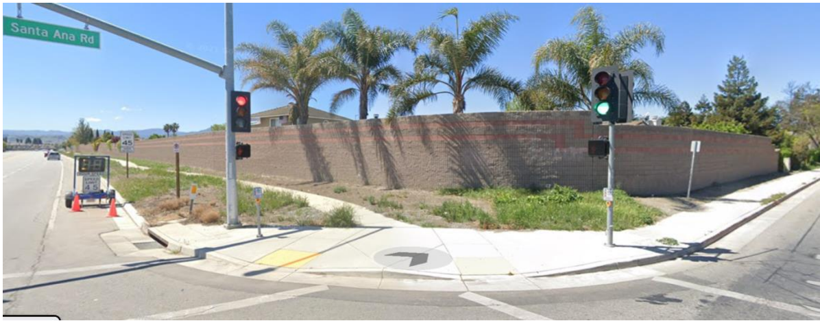
Figure 1 Corner of Santa Ana & Highway 25, facing southwest