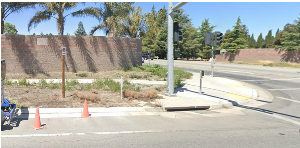
Figure 3 Corner of Santa Ana & Highway 25, facing west